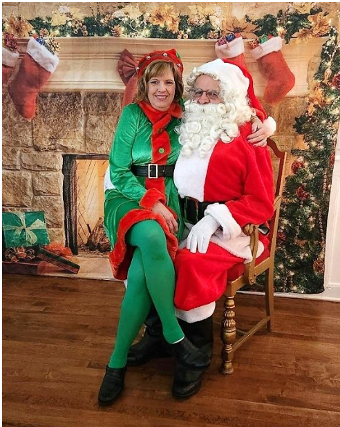
Now who's being naughty?