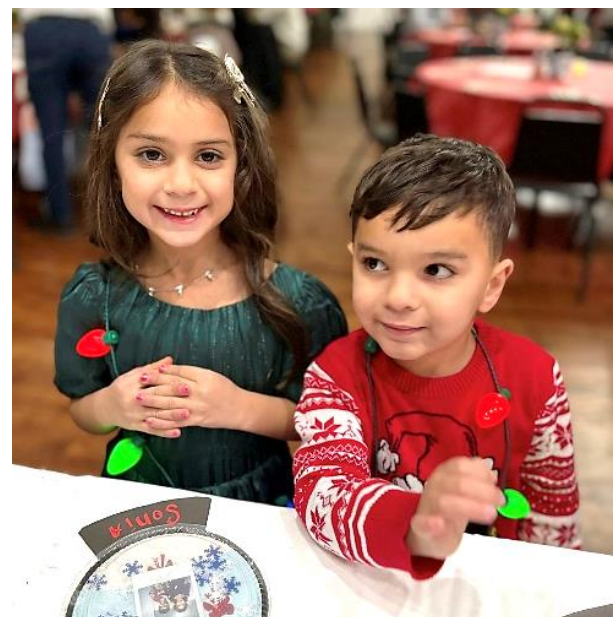
Snow globe crafts with kids' pictures