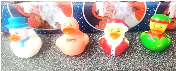
Snowman, ginger bread, Santa, and elf rubber duckies