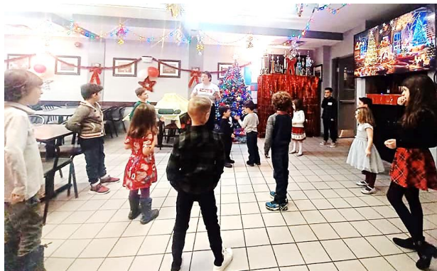
Listening to instructions for a dance game