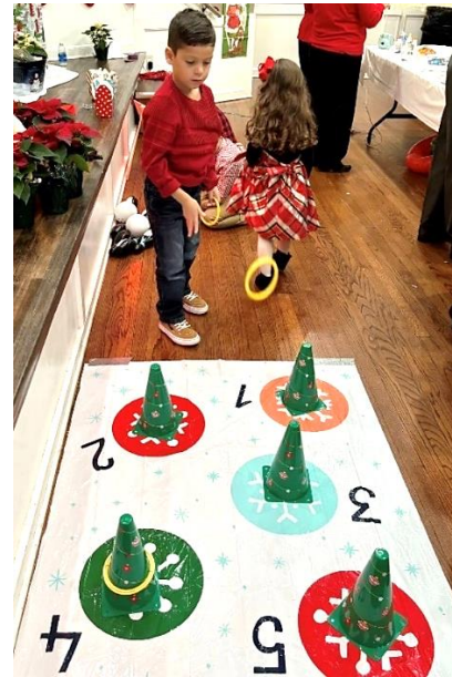
Christmas-themed ring toss