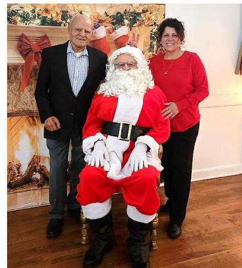
You're never too old for a picture with Santa