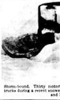
Storm-bound. Thirty motor trucks during a recent snow and 3

This is believed to have come from a December 1926 issue of The Detroit Free Press .