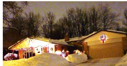
Our home, December 2015

Merry Christmas and all the best of the new year from our house to yours.