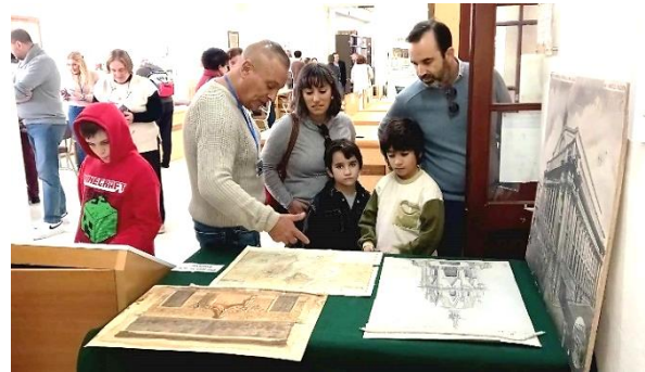
The Reading Room at the National Archives in Rabat