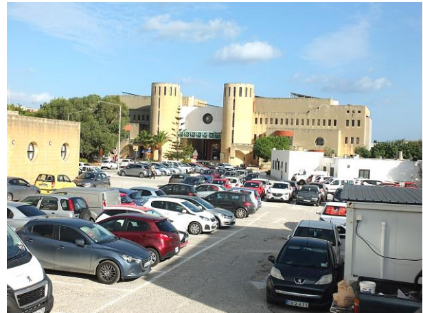
Main entrance to the University of Malta