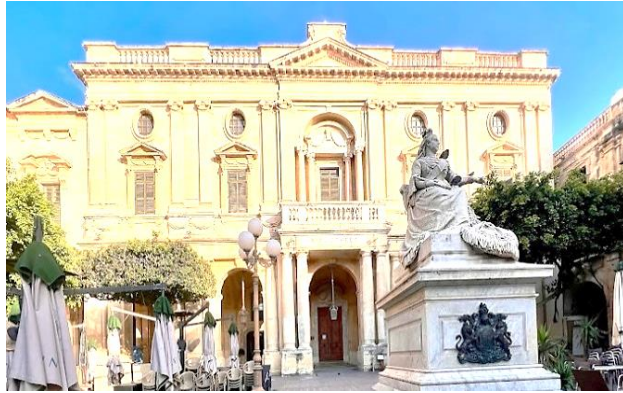
Images of the National Library