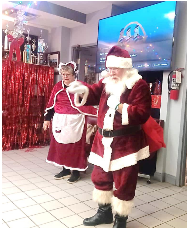
Mrs. & Santa Claus