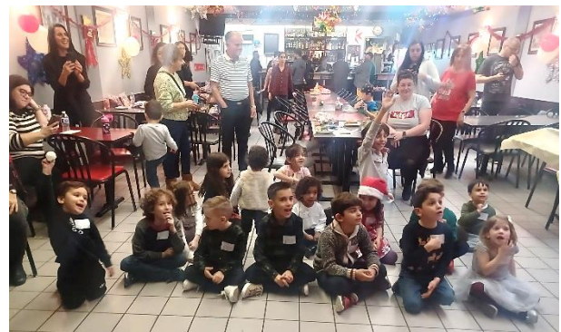
Kids listening to Santa

The Club held its Children's Christmas Party on Sunday, December 10 th .