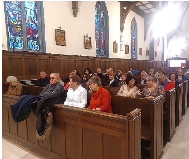
Our group before Mass at St. John's Church