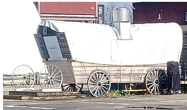
A conestoga wagon seen at St. Jacob's