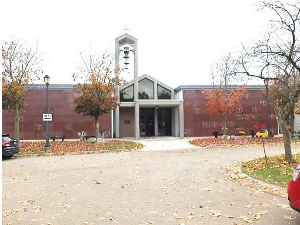
Holy Family Mausoleum

Owing to the COVID pandemic, it has been four years since the local Maltese group and friends have been able to have a memorial service in Holy Family Mausoleum, St. Peter's Cemetery, London, Ontario. This year a service was held on the afternoon of Thursday, November 2 nd (All Souls Day.)