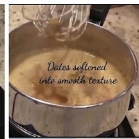
Dates softened into smooth texture