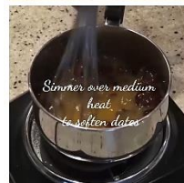
Simmer over medium heat to soften dates