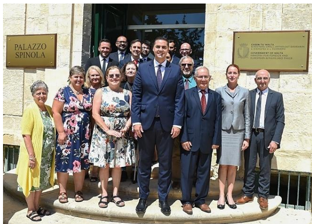
Group photo of all the councillors with Ian Brog Minister for Foreign and European Affairs

Council members usually meet in Malta once a year; however, during Covid we had Zoom meetings. This year the meeting was held in Malta at Palazzo Spinola, St Julian's on September 11 th and 12 th . The Minister for Foreign and European Affairs and Trade Commission was in attendance for the first part of the meeting. We welcomed two new councillors, one from Vienna and one from Budapest. Most of the other councillors have been on the Council for five years and the maximum term one can serve is six.