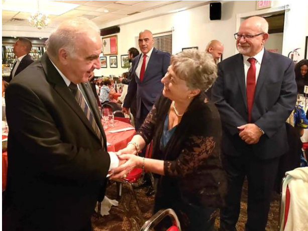
Meeting in Toronto with the President Malta

In May I joined the Maltese community in Toronto to welcome H.E. The President of Malta George Vella. I attended a business meeting with my counterpart in Ontario and the Honorary Consuls from other Provinces. Later, I attended a formal reception held at the Maltese Band Club in Mississauga, Ontario.