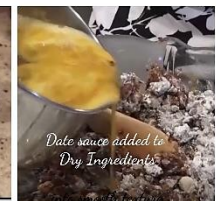
Date sauce added to Dry Ingredients

Preparing Date Paste to add to Dry Ingredients