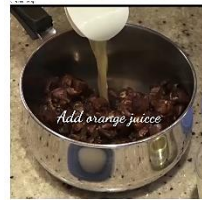
Add orange juice