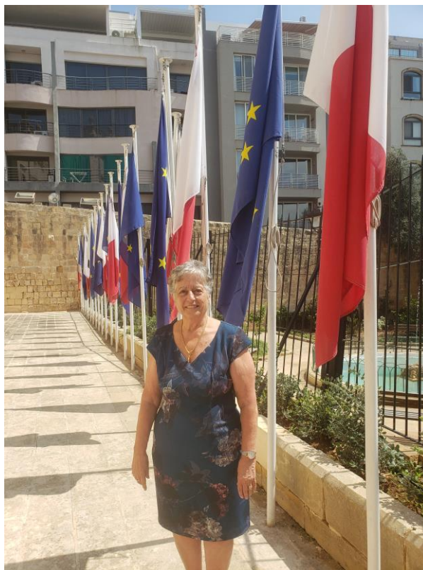
Me outside Palazzo Spinola, St. Julian's

We discussed how we can make the application for dual citizenship less complicated, especially when it is a matter of renewing one's Maltese passport. The "Consul on the Move" programme is expected to be in full swing in 2024.