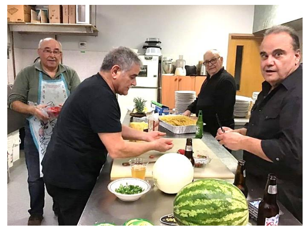
The event was a great success and will hopefully become an annual event.

All the preparations for this event were handled by some hard-working gentlemen from the Club in appreciation of everyone's support throughout the year.