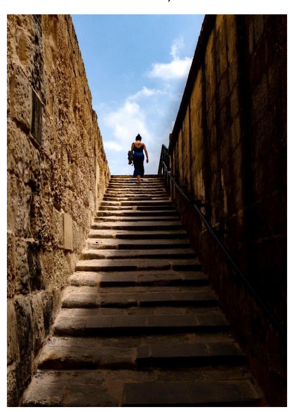
The Staircase, Birgu Second Prize winner for "Women in the 21st Century" theme competition for the IV International Biennial of Photography, Ecuador, May 2022