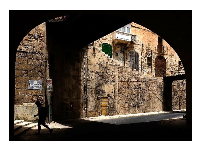
Under the Gate, Valletta