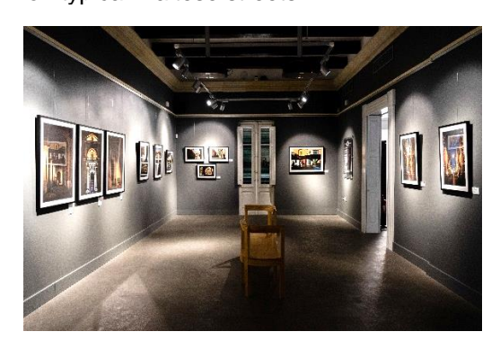
Some of the frames at the exhibition

Her first solo photography exhibition, "Memories of My Island", was held last summer at the Malta Postal Museum in Valletta. The exhibition showcased her spin on typical Maltese streets.