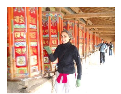
Spinning prayer wheels at Labrang Monastery, Tibet