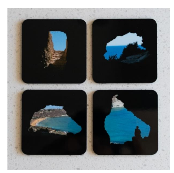
Set of four coasters with photo silhouettes of the Mixta Cave, Gozo

calendars, coasters and photo books. These proved www.nickycontiphotography.com/shop. to be small treasures for those who bought them, as well as those who got them as Christmas gifts. Just recently, she has launched a set of placemats.