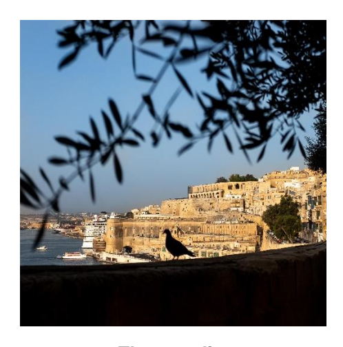
The guardian One of the photos displayed at "Memories of My Island" photography exhibition, July-Aug 2022