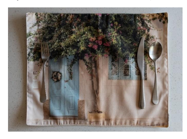
Light blue door placemat