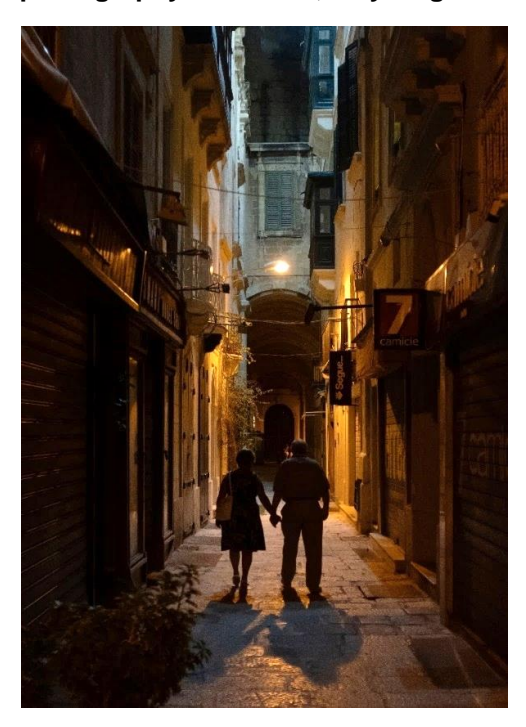
Night Stroll, Valletta Auctioned online in aid of The Malta Community Chest Fund Foundation, December 2021