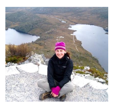
On top of Cradle Mountain, Tasmania, Australia