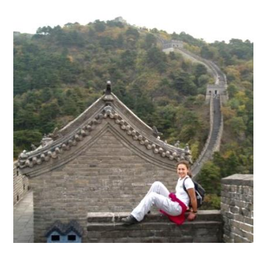
On the Great Wall of China